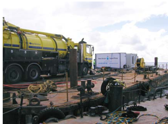
Hi-vac lorry jetting unit and portable dive trailer on work barge during 700m outfall cleaning operation