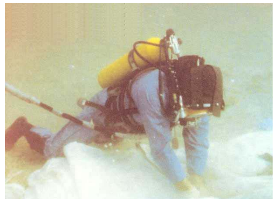
Placement of concrete stabilisation mattress to support section of pipe spanning sea bed

Under-scouring is the major cause of joint displacement and subsequent failure. The problem is easily overcome by the timely placement of concrete stabilisation mattress.