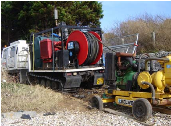
All-terrain HP jetting rig deployed at beach access hatch to support pipe-cleaning operation on remote access location

The winching system is 'low-impact' and presents none of the damage hazards associated with traditional winching such as abrasion damage and joint displacement. The system is easily deployed by divers.